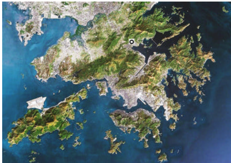
Figure 1(a) Location of Fung Yuen SSSI & Butterfly Reserve within Hong Kong.

was only noted for the KFBG sessions (using a Garmin global positioning system unit GARMAP 60 CSx); for the remaining observations, no record exists of which part of Fung Yuen the observations were made.