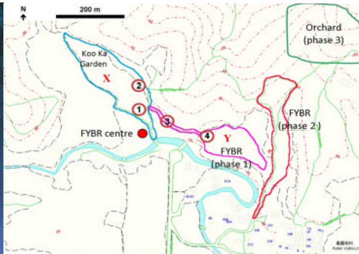
Fig. 1(b) plan of Fung Yuen SSSI & Butterfly Reserve, indicating locations recorded by the KFBG survey.

including the existing “Hong Kong Moth Recorder” database of the author, amounting to just over 60,000 records, and Chinese distributional data from collections at South China Agricultural University and Nankai University Insect Collection. The species richness ratio of Geometridae to Noctuidae (following Kitching et al., 2000) was compared with that of Kadoorie Farm to gain insight on the level of disturbance at Fung Yuen.