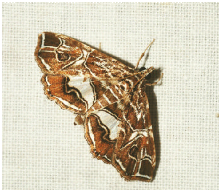
Figure 7. Paracymoriza vagalis (Crambidae, Acentropinae) – a chink-mark moth, whose larvae are aquatic and require unpolluted water to survive

As yet, it is not possible to draw many conclusions about species assemblages due to insufficient recording effort, but some generalist species were present. Six of the seven species found at all the sub-sites recorded in the 2009 survey (Kendrick,