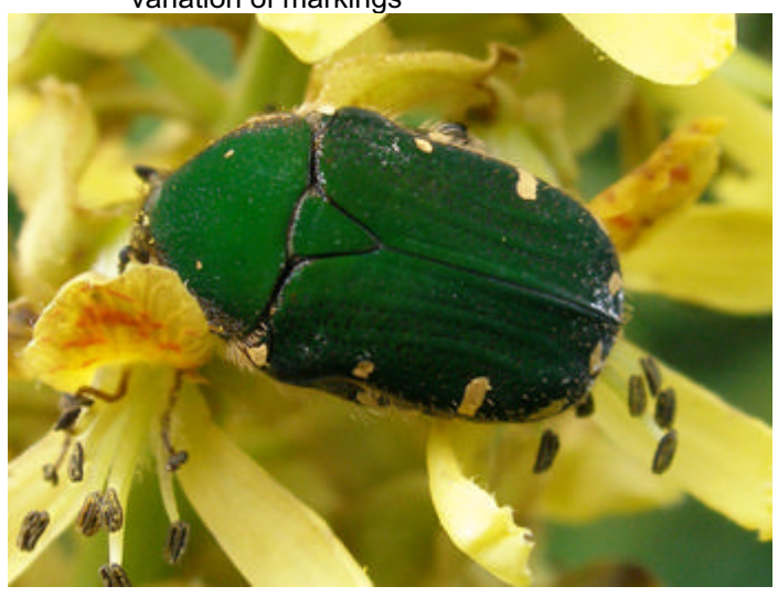
Fig. 11.3 Gametis jucunda - clypeus and pronotum

Fig. 11.2 Gametis jucunda - dorsal view showing variation of markings