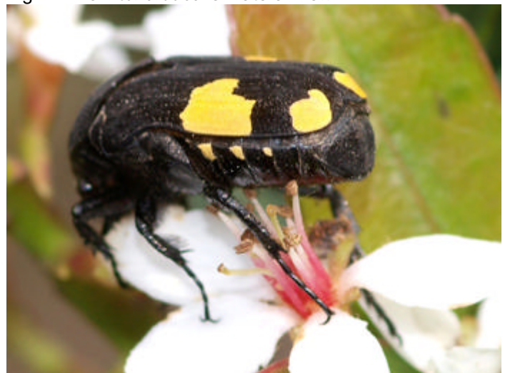
Fig. 14.2 Clinteria ducalis - lateral view