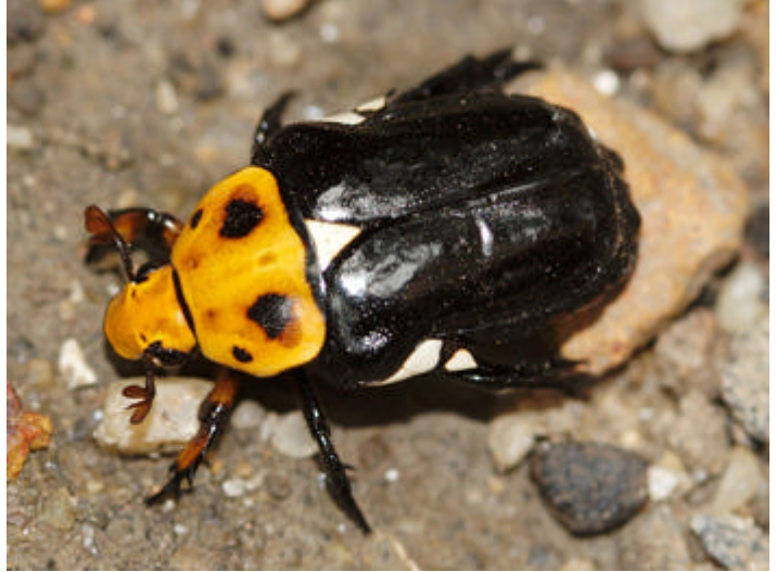
Fig 1.5 Campsiura javanica - variation of markings on pronotum