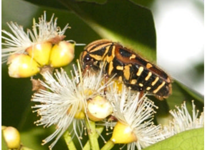
Fig. 13.3 Euselates schoenfeldti - pygidium

Fig. 13.2 Euselates schoenfeldti - lateral view