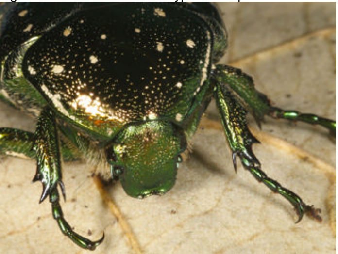
Fig. 7.2 A Protaetia orientalis - feeding on a flower

Fig. 7.1 Protaetia orientalis - clypeus and pronotum