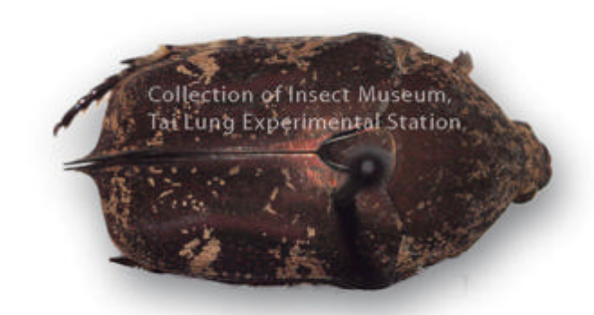
Fig. 8.1 Protaetia fusca - dorsal view

There are 18 specimens deposited in the Insect Museum, Tai Lung Experimental Station, Hong Kong, which were collected from 1963 to 1999, in Ta Shek Wu, Tai Lung and Ngau Tam Mei respectively, in the period of April to November.