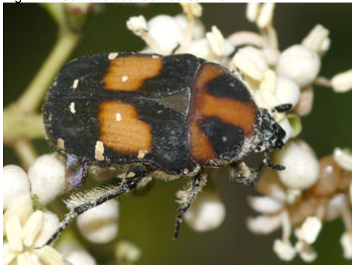
Fig. 12. Gametis bealiae - clypeus and pronotum