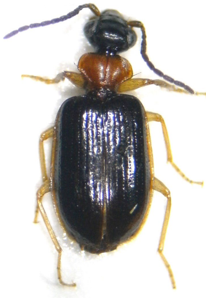
Figure 1. Pentagonica pallipes (Nietner, 1856).